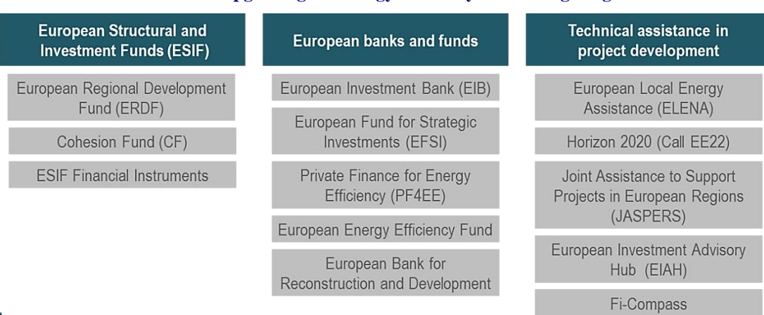
Figure 2: Financial support and technical and advisory assistance available from EU funds and institutions for upgrading the energy efficiency of street lighting